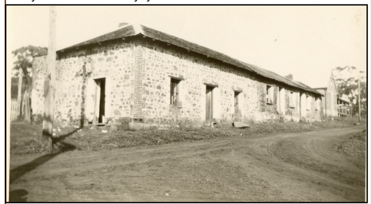
The Toodyay Convict Depot Warders Quarters were located in Fiennes Street between the Courthouse and the Masonic Hall. They were demolished in the early 1930s.

Entry is free for all Toodyay residents to both our museums.