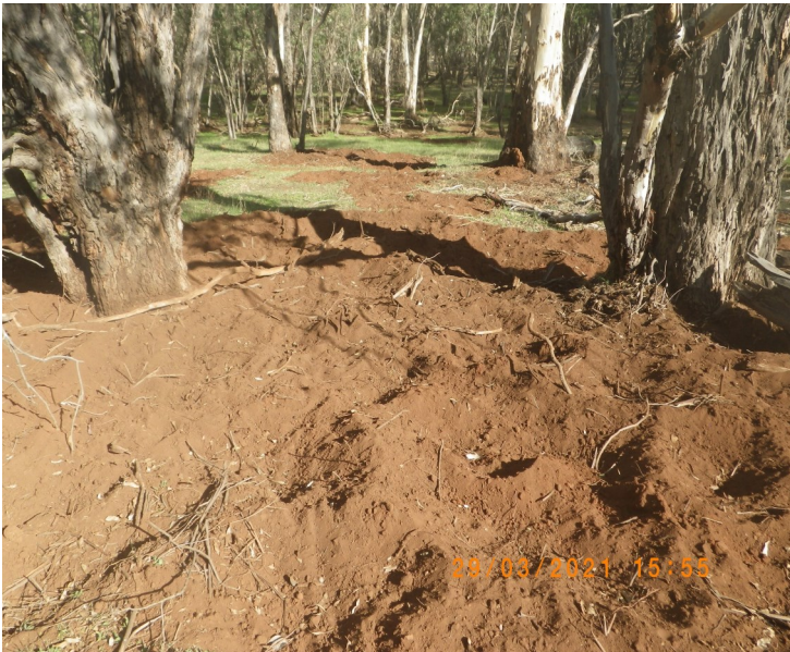
Pictured: damage caused by feral pigs