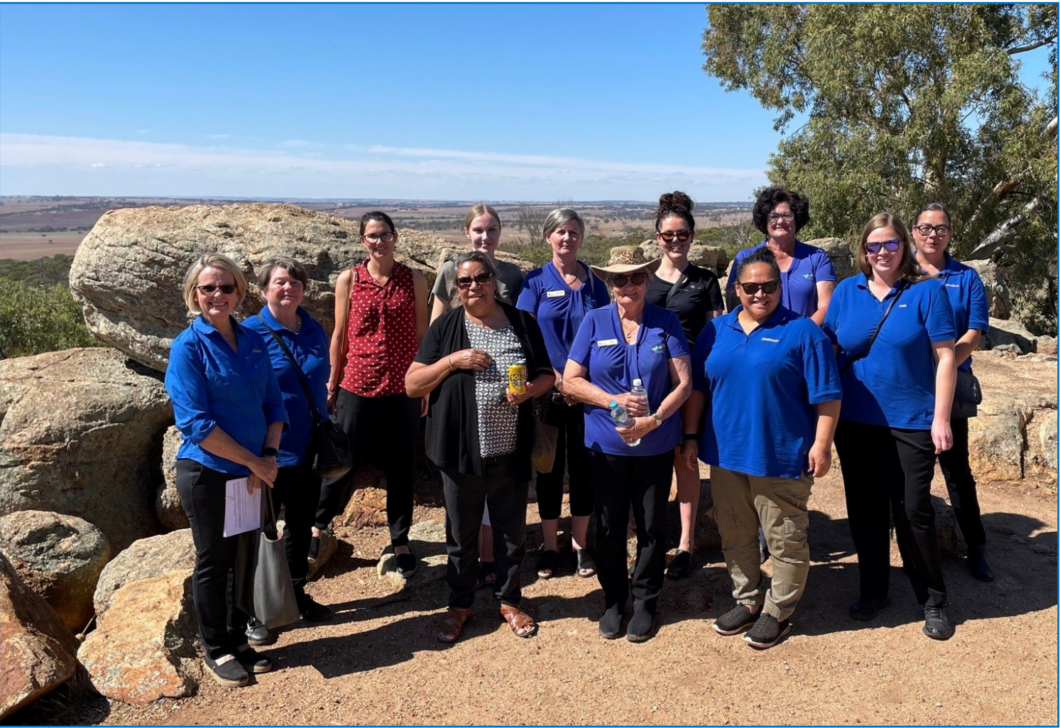
Pictured below: The VC teams on Mt Brown in York.

The Toodyay VC has thoroughly enjoyed these Famil Tours and learning about our neighboring towns. Toodyay is looking forward in working with the other districts to support and promote one another and continue promoting the Avon Valley as a fantastic place for tourists to visit.