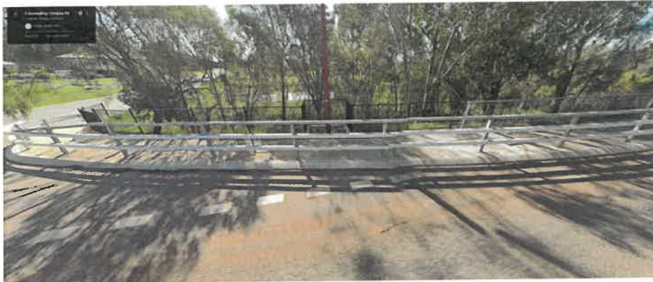
Proposed location for installation of fence

Is there any chance that a pedestrian handrail/fence can be installed at the footpath that joins the Goomalling Toodyay Rd and Drummond St as the drop-off in some areas is greater than 2m and I believe it represents a risk for the pedestrians, especially kids. Please refer to picture below of the other side of the bridge near Mercy Retreat where a black fence was installed to mitigate that risk.