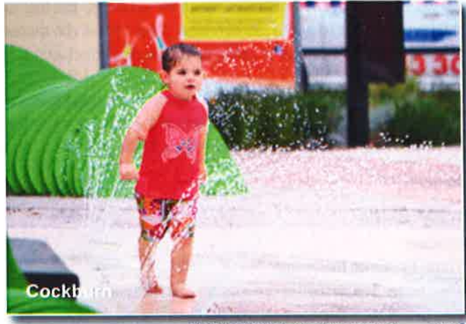
@WFBD Pty Ltd. All rights reserved.