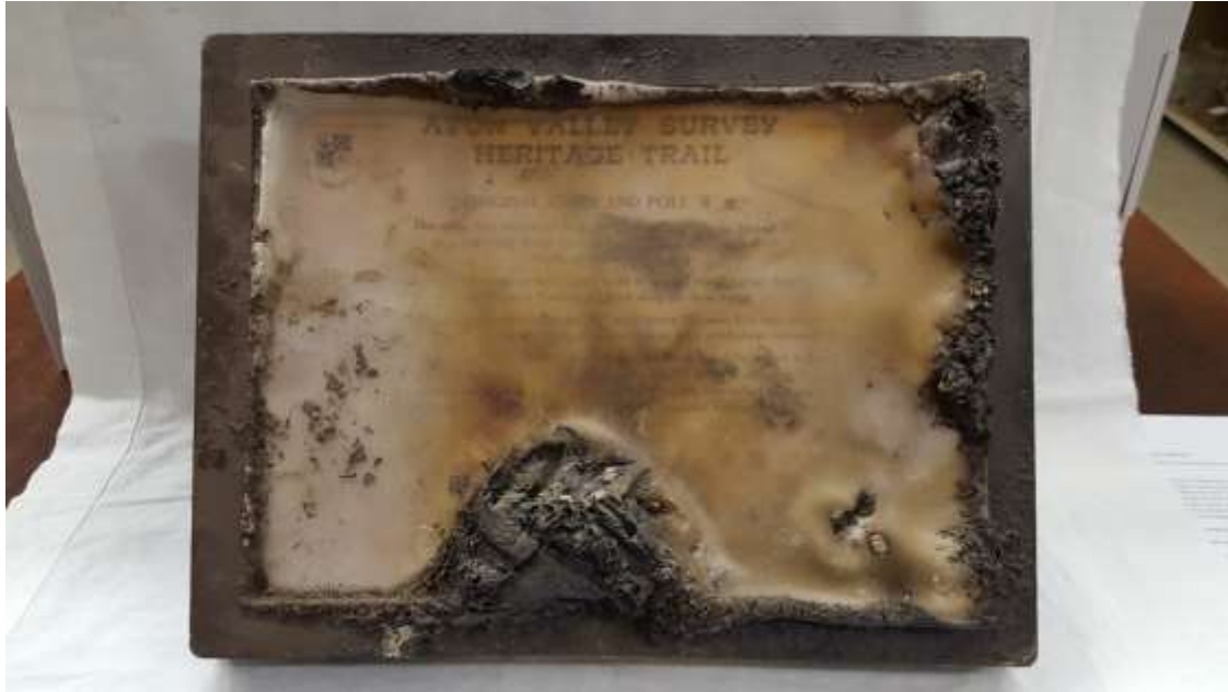
Burnt metal sign Fundraising – concert gift package

Objects associated with the 2009 bushfire: