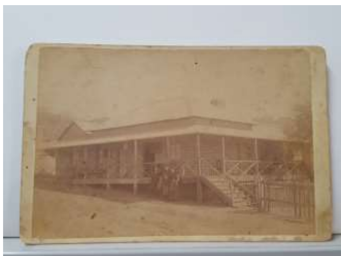
Rose Cottage, Clinton Street, Toodyay

Group of 5 historic photographs from same donor (from Brookton) which are believed to be of a Toodyay subject.