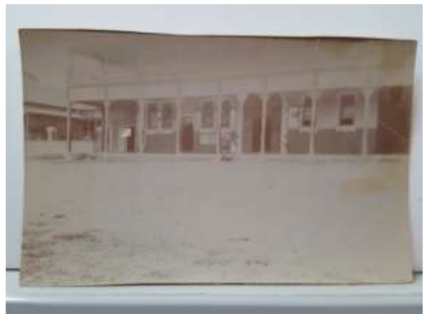
Victoria Hotel, Toodyay

Unknown house (not identified but had been stored with other Toodyay photos)