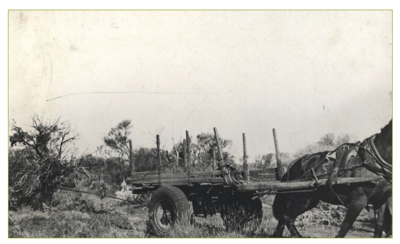
Tree removal (probably sandalwood), horse and cart Shire of Toodyay local history collection 2000.56