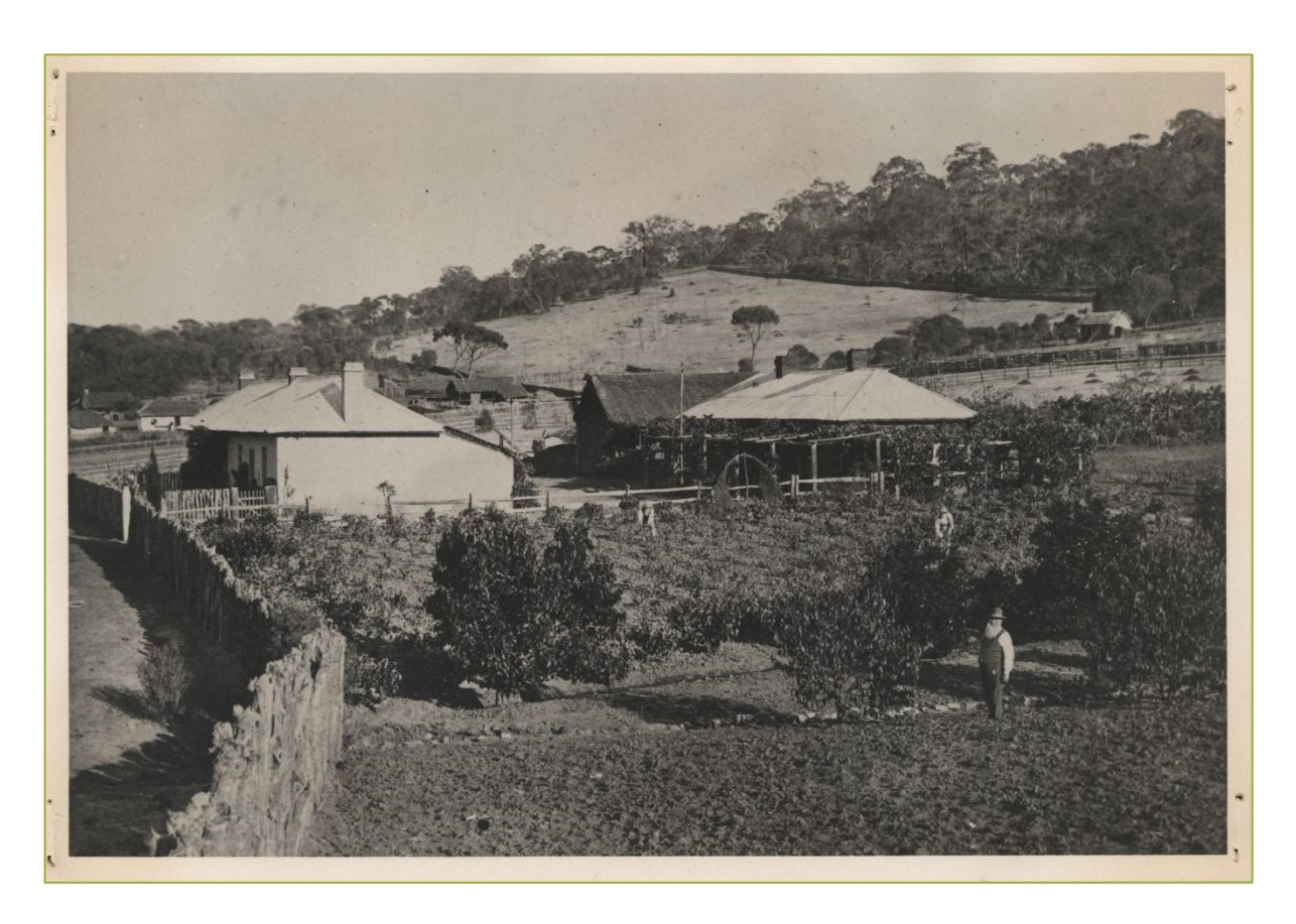
Small orchard, vines and James Everett in foreground Shire of Toodyay local history collection 2001.743

Horse drawn wagon loaded with bags.. Shire of Toodyay local history collection 2014-250