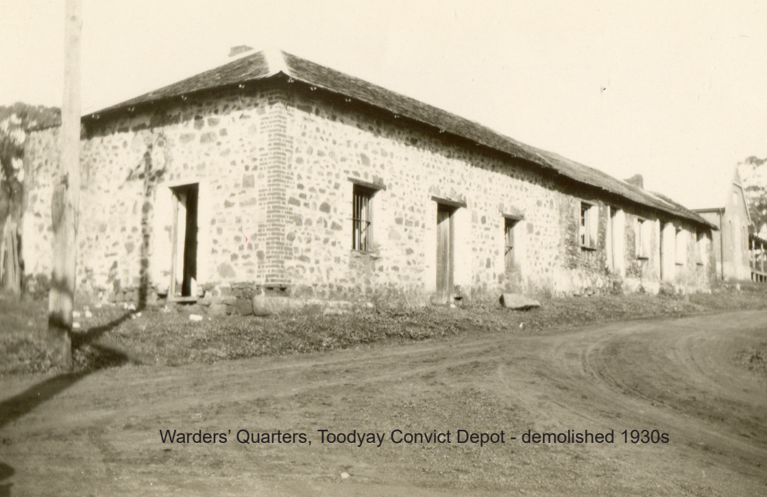
Warders' Quarters, Toodyay Convict Depot - demolished 1930s