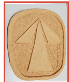
Broadarrow trail markers

Allow an extra half hour to visit the Newcastle Gaol Museum at the half-way mark