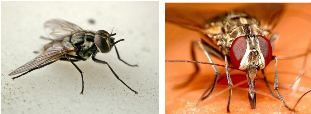
Figure 1. Adult stable fly at rest (Left) and feeding on a human (Right).

Stable fly ( Stomoxys calcitrans ) are closely associated with humans and their activities and is a serious pest of livestock around animal enclosures, stables, feedlots and paddocks or pastures. First recorded in Australia in 1881 and in Western Australia in 1912 this fly is very heat tolerant and is present in large numbers from late spring through to late autumn throughout many areas of south-western Australia.