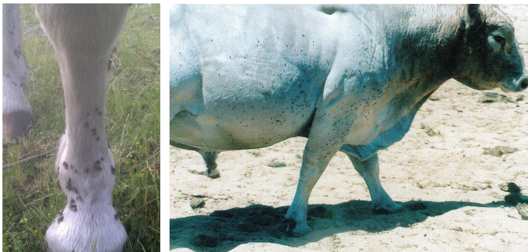
Figure 2. Adult stable flies feeding on a horse (Left) and covering the side of a bull (Right).

Cattle and horses are most affected by the stable fly (Fig 2). They will try to avoid the fly by foot stamping, tail switching, throwing their head down toward their front legs, and kicking sand up onto their legs and body. In cattle and horses this can lead to reduced weight gain from continual movement, and allergic reactions on their skin from the flies feeding. When stable flies are present in large numbers (>25/animal), cattle will often bunch together in an effort to get to the centre of the group and avoid the fly, or they may stand in open water to avoid being bitten. This continual agitation reduces the animals normal grazing and many have moved to feeding at night when the fly is not active. This bunching by cattle is particularly hazardous in summer where animals can be at risk of heat stroke. Stable fly numbers can be monitored by counting the flies on all four legs of about 10 animals. When the average numbers is >10 flies/animal (treatment threshold), control measure should be implemented. At >20 flies/animal, measurable reductions in weight gain and condition occur with numbers >50 flies/animal reducing weight gain by 25% and milk production by 40-60%.