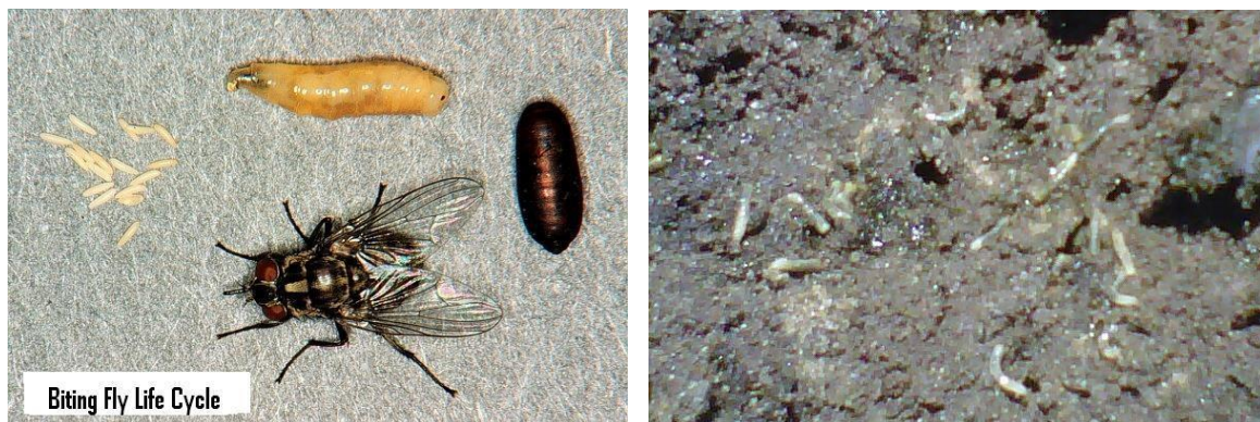
Figure 4. Adult stable fly life cycle (LHS) and stable fly larvae in rotting vegetable residue.

The life cycle of the fly, from egg to adult, is about 13-18 days in temperatures ranging from 24-30°C (Fig. 4). After obtaining and ingesting a blood meal, the female fly lays around 90 eggs over 4-5 different places in rotting vegetable matter or ageing animal manure mixed with organic matter (and up to 600 eggs in her lifetime). The eggs hatch in as little as 20hrs where the active larval stages feed for up to a week at 30°C and much longer in cooler temperatures. The larvae or maggots feed and grow over 5 to 8 days and are extremely heat tolerant, surviving on our hot, grey-black sands. In warmer areas the stable fly may breed all year and in lower temperatures (10-15°C) development from egg to adult takes 3 to 5 months.