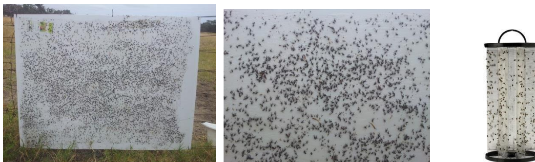
Figure 5. The Williams Trap (Left) and a commercially available stable fly trap (Centre)

The simplest form of a biting fly trap that uses a white board or panel with a non-drying glue painted onto the surface to catch the flies. These traps are specific to biting flies and will catch very little else, so they are very effective. Secure the white board to a star picket or along a fence line with cable ties at 1m from the ground to avoid getting covered in dirt and dust. Paint one or both sides of the board with the non-drying glue, which must be heated on a hot plate first till it has thinned and can be painted on more easily – it must be painted on quickly and any drops on you or anything else will only come off with baby oil. You can buy simple white boards such as Corflute for less than $5 (900 x 600mm) as well as Melamine, Aligloss, Acrylic sheets, Masonite white boards and MDF Melamine. Stikem® is available in Australia from www.theolivecentre.com (3kg tins cost $120 + postage) and also from www.bugs4bugs.com.au (3kg costs $78.50 plus postage); a 3kg tin will easily paint 30 trap boards. Once the white boards are covered with flies, remove with a paint scraper then repaint on the glue. Multiple boards cleared daily and re-painted with gel can remove several thousand stable flies. Remember that protein-based traps (rotting smell) put out to catch houseflies, blowflies and bushflies WILL NOT catch stable flies.